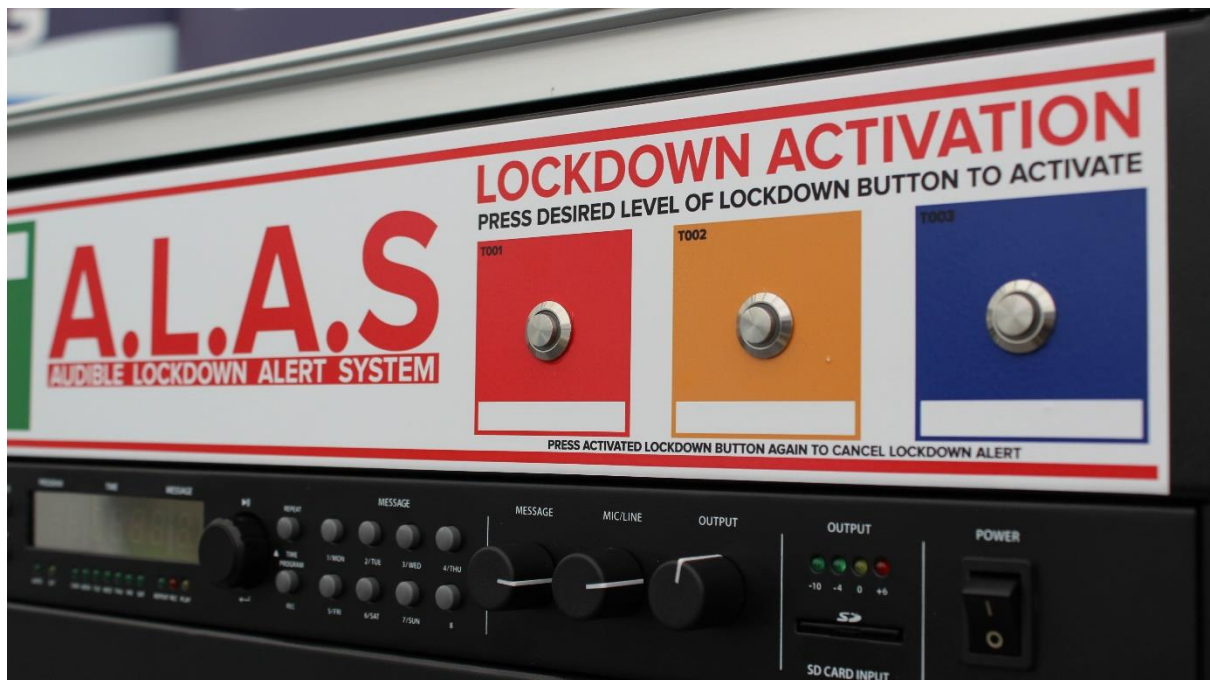
A.L.A.S System MK II